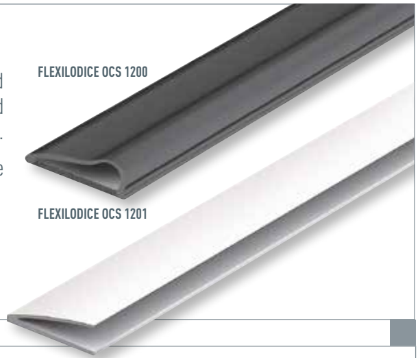
FLEXILOCICE OCS 1201